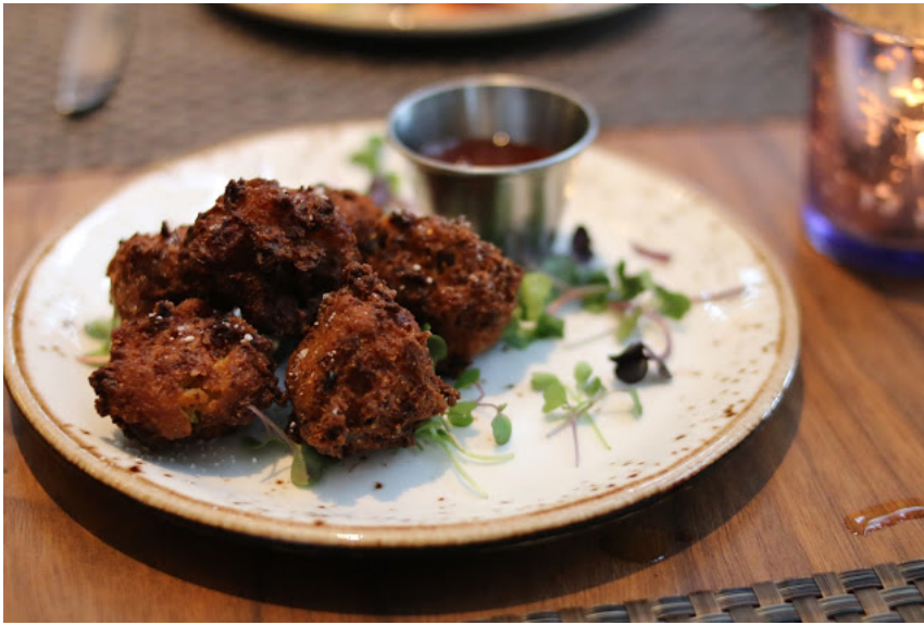
Crawfish Beignets / Tabasco Syrup