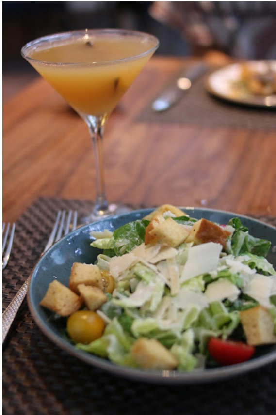
Caesar Salad / Chopped Romaine, Pecorino Cheese, Garlic Croutons, Cherry Tomatoes

For the break in between out entrees, my sister and I decided it would be smart to incorporate some greens into our meal. She opted for their Caesar Salad, while I went with the Baby Tuscan Kale Salad. If there is ever a kale salad on the menu, I must try it! I loved their twist on the kale salad, because they kept it somewhat simple. The salad is topped with toasted almonds, parmesan cheese, fried garlic, lemon segments and drizzled with a honey-cider vinaigrette. Hungry yet?