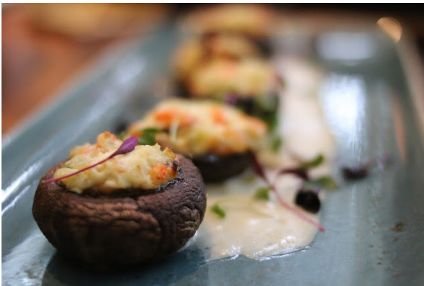
Baked Portobello Caps / Carrots, Celery, Shallot, Bleu Cheese Béchamel

See what I mean?! I can honestly say I enjoyed all of the starters, but if I had to pick one favorite, I would go with the Shrimp Skewers. The sauce on the shrimp is heavenly and not too overpowering.