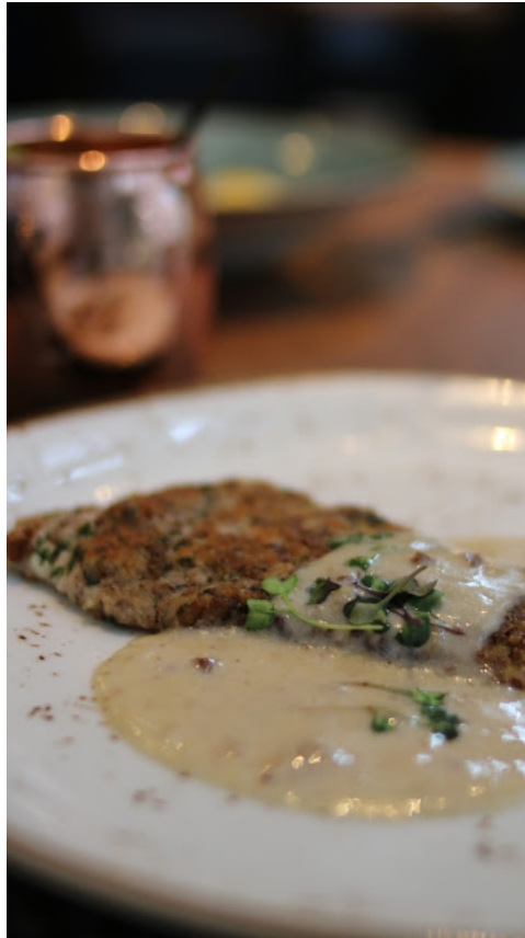
Pecan Crusted Flounder / Honey Butter Sauce

When our server came back by to see how our meals were, he noted that there was still one final course. Since we had just eaten the entire menu, I told him I wanted something small. He mentioned that the serve cute, little "bite!" Just the right amount to finish off a meal!