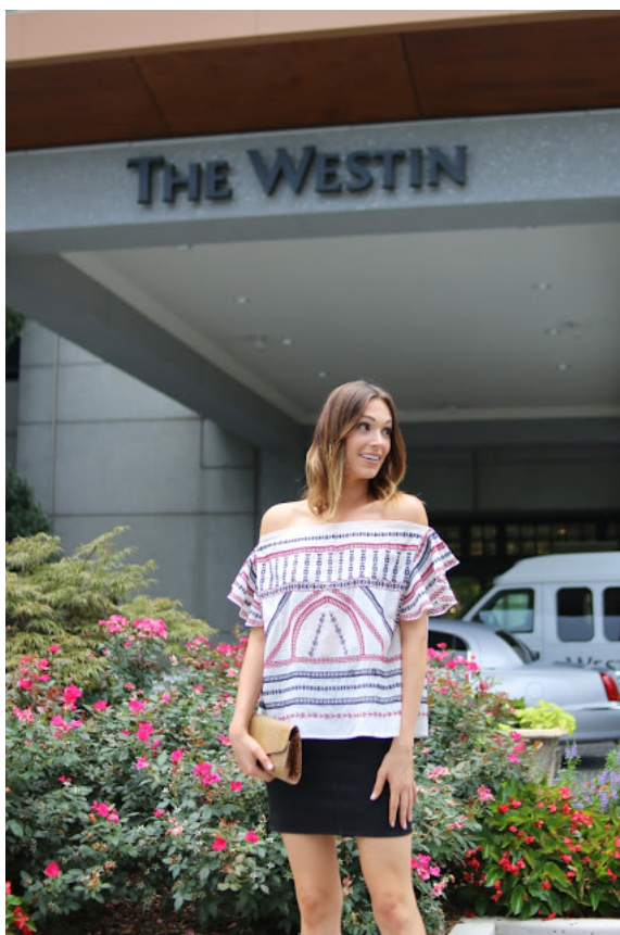
Outfit Deets: Love Sam Top (Kane Boutique) / Paige Denim Skirt (Kane Boutique) / Forever 21 Clutch (Old), Similar / Zara Heels

Recently, my sister and resident photog, moved back to the city, so I decided we needed a Friday date night at SAVOR bar & kitchen! Nestled right off the busy interstate that is I-285, SAVOR is this hidden oasis away from all the chaos.