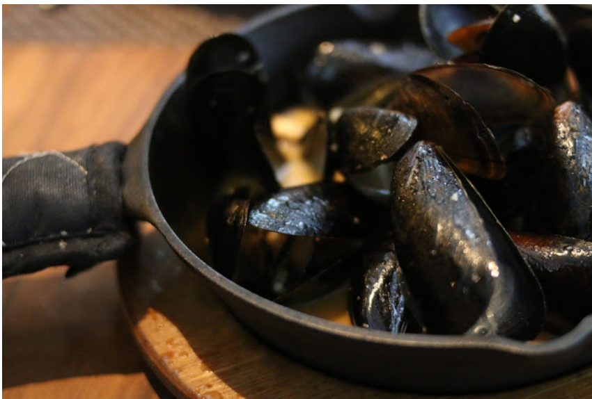
Mussels' Skillet / Garlic, White Wine, Sea Salt, Grilled Bread