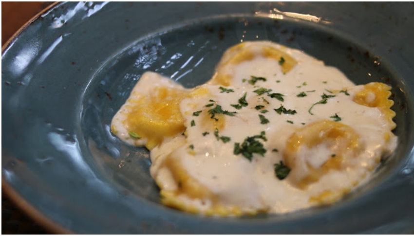
Butternut Squash Ravioli / Bartlett Pear and Sage Cream Sauce