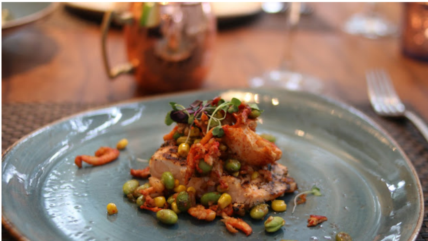
Grilled Scottish Salmon / Corn, Lobster, Edamame, Brown Butter