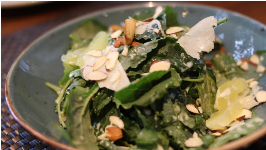
Baby Tuscan Kale Salad / Lemon Segments, Toasted Almonds, Parmesan Cheese, Fried Garlic, and Honey-Cider Vinaigrette