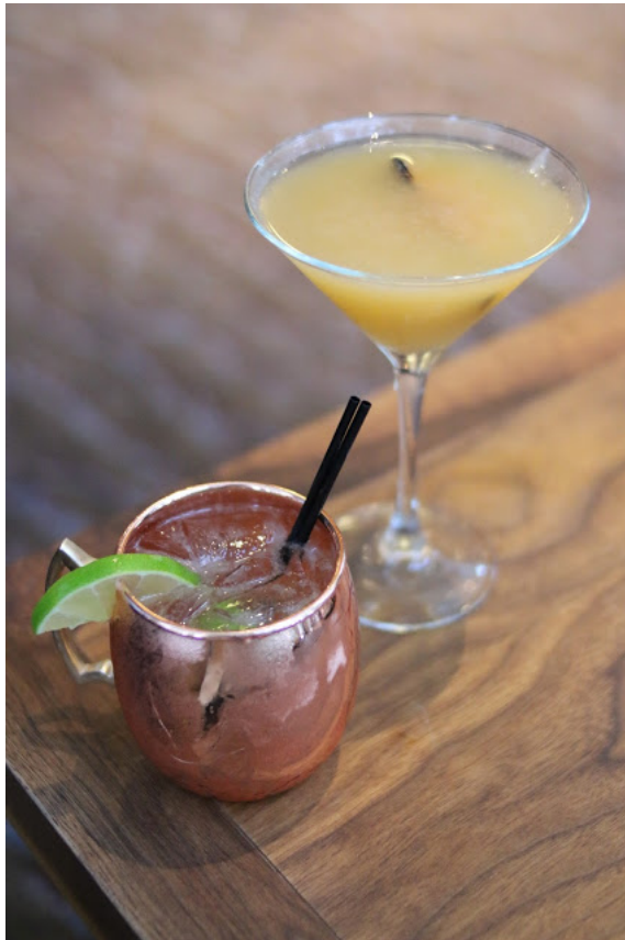
Moonshine Mule + Peach Cocktail