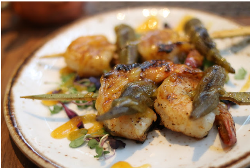
Cajun Shrimp Skewers / Wicked Okra, Peach Pepper Sauce